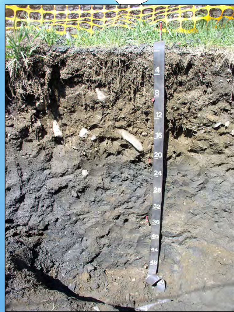
Newport soil formed in dense glacial till derived from dark colored materials of the Narragansett structural basin.