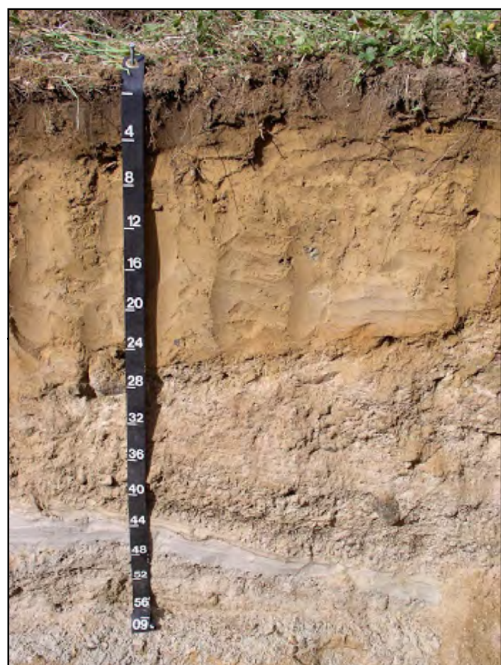
Enfield soil formed in stratified sand and gravel outwash with a silt loam windblown loess surface. The finer materials at the surface make this a prime farmland soil.