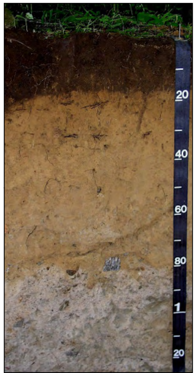
Narragansett soil is formed in windblown silts (loess) over ablation till. This unofficial Rhode Island state soil is a prime farmland soil.